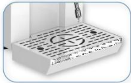
Magnetic Water Filter Tray

Dispose of wastewater cleaning is more convenient