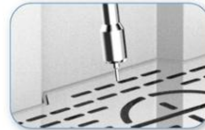
Built-in Probe Design

Prevent liquid back suction when the valve is closed, causing pipeline contamination