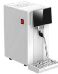
Left 45° View